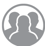
PAPŌRI ME TE AHUREA Social and Cultural