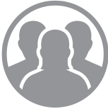
PAPŌRI ME TE AHUREA Social and Cultural