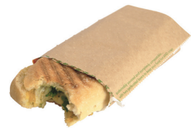
Vegetable wax coated paper

This is the only greaseproof paper which can be composted