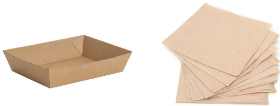
Unlined paper & cardboard

Materials accepted into the commercial compost include certified food packaging products made from: