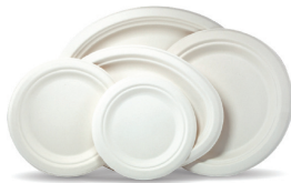
Sugarcane or Bagasse