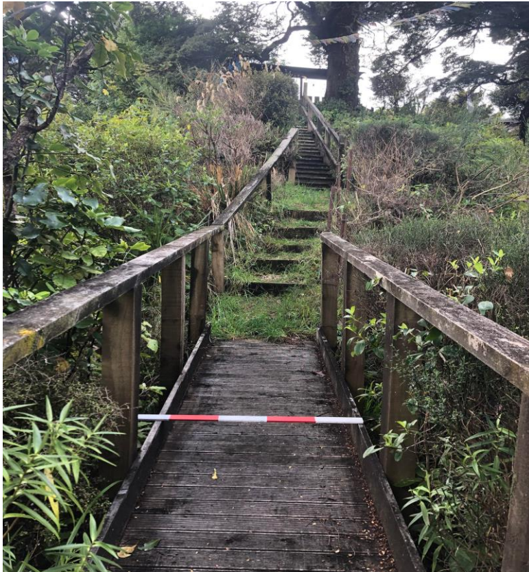
Figure 3: This image facing north shows some of the work undertaken by the owners to make the area accessible. The bridge is built over the transverse ditch which is also protected by vegetation. Note also the stairs and vegetation probably hide further defences. Scale is one metre.