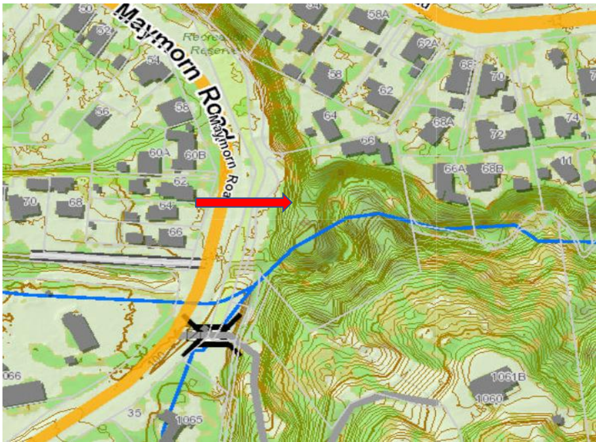
Figure 1: Map showing the location of the ditch on the pa on a LIDAR map.