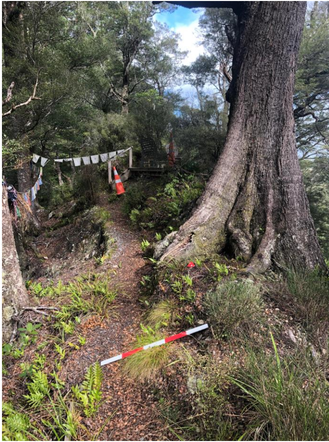
Figure 5: This image facing south shows the general width of the pa with large drop offs on either side. Of note is the large tree which is likely to have been there for several hundred years.