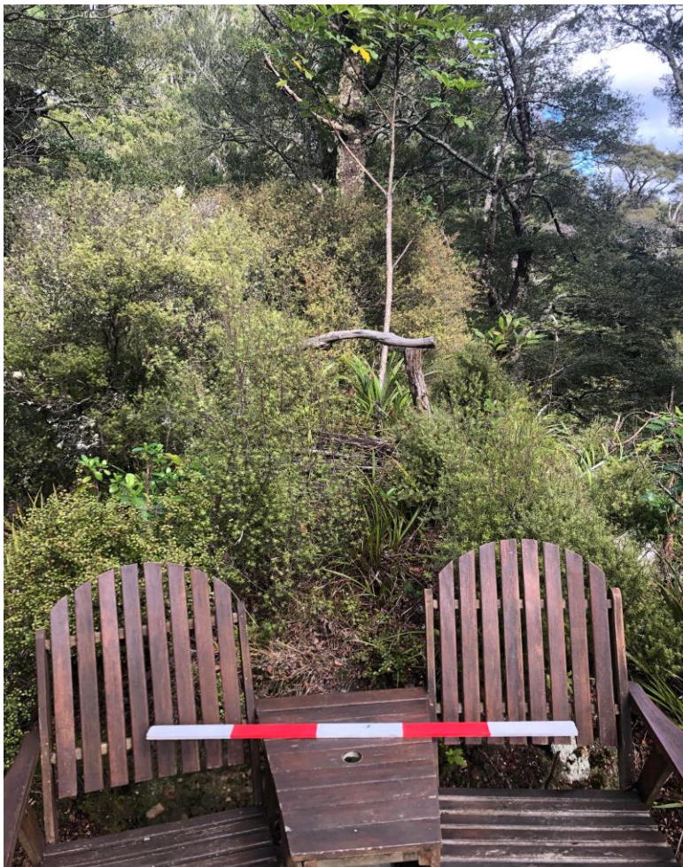
Figure 4: This image facing south shows the highest point of the pa marked by a wooden sculpture in the middle. The chairs below are on the deck built by the owners which has cut into the surface.