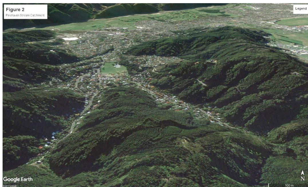
Figure 2: Pinehaven Stream Catchment.