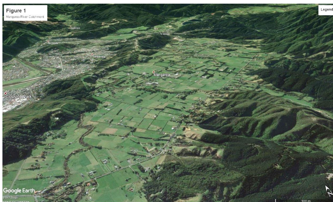
Figure 1: Mangaroa River Catchment. (image source: Google Earth 3 )